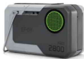
Fuel cell with up to 125 W.