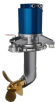
Full electric propulsion