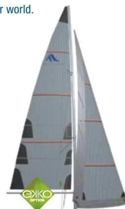
Elvstrøm EKKO Sails