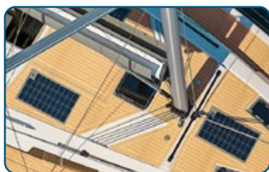
Integrated solar panels

Lead the charge towards a sustainable future with our carbon-neutral full electric propulsion. A remarkable 55 NM range sets a new standard in eco-conscious sailing. Crafted from PET, our sustainable performance sails not only deliver unparalleled performance but also make a bold statement in environmental responsibility. Embrace green energy with an integrated fuel cell, ensuring every wave you conquer is a step towards a cleaner world. Green energy takes center stage with the integration of a fuel cell, making every journey a step towards a greener future.